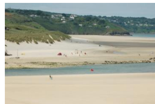
Lelant Beach from Hayle Towans Porthkidney from Hayle Towans

considerably throughout the year and during spring tides can be minimal. Lelant Beach is mostly sand nearer the mouth of the estuary but can be stony with shingle opposite the stony spit that separates the two arms of the river.