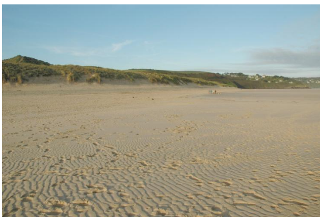
An autumnal view of Porthkidney Sands at low water

These beaches are one of the same although the area on the western side of the River Hayle is usually referred to as Lelant Beach whilst the large area of sands backed by sand dunes is Porthkidney Sands. The beaches usually for the north coast face north/east and form part of the southerly area of the wonderful St.Ives Bay. Across the river is Hayle Towans .