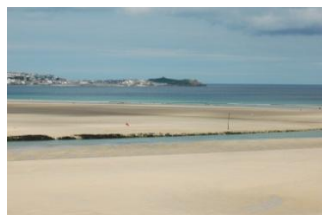
Porthkidney Sands at low water