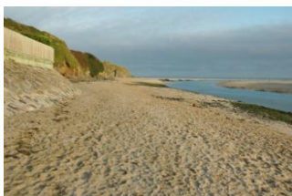
Lelant Beach next to the River

It is a wonderful expanse of fine yellow sand at low water which is at its widest next to the mouth of the river. The amount of sand at high water will vary