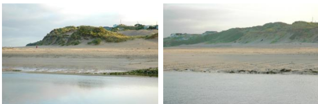
Views of the beach next to the River Hayle

Hayle Towans starts at the River Hayle and the Estuary and loops round to Black Cliff, which at high water separates it from Mexico Towans and the long stretch of beach northwards. The word 'Towans' is a Cornish word meaning sand dunes. Part of Hayle Towans is often referred to as Harvey's Towans after the Hayle family that began Harvey's Foundry that was world famous at the height of the mining era in the 19 th Century and was largely responsible for the development of Hayle as an important port. The once port of Hayle is now little more than a small fishing harbour largely due to the difficulties of negotiating the mouth of the river at low water. The part of the beach next to the River is particularly dangerous because of the strong currents. Upstream the river not only has the harbour but opens up to the important wildlife areas of Lelant Saltings, Carnsew Pool and Copperhouse Pool. The word 'Hayle' is derived from the Cornish 'Heyl' meaning estuary. Hayle beach adjacent to the river is opposite Lelant