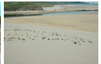
Looking to Porthkidney Sands

Coast Path after a 400m walk on Black Cliff there is the access down the dunes to Mexico Towans Beach. Alternatively to get to the Estuary end of the beach – TR27 5AS - from the A30 take the B3301 into the centre of Hayle. North of the railway viaduct and the harbour there is a sharp right hand bend; just beyond there is a narrow bridge on the left that leads to the former industrial area of North Quay. The road gives way to a sandy track that leads to a parking area (capacity over 150 cars) on Harvey's Towans above the mouth of the estuary. There is a short path down through the dunes to the beach at the side of the river. By continuing along the Coast Path from the car park past some old chalets there is a path down the dunes to the northerly facing beach. Mexico Towans can also be reached from Phillack village by a public footpath from Chuchtown road along Mexico Lane.