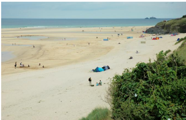
The beach at Hayle Towans at low water

These beaches are at the southerly end of the wonderful sweeping stretch of sand on the southerly side of St.Ives Bay that is over 5.5kms long from the Hayle Estuary in the south to Godrevy Cove in the north with Common Towans , Phillack Towans , Upton Towans , and Gwithian Towans in between.