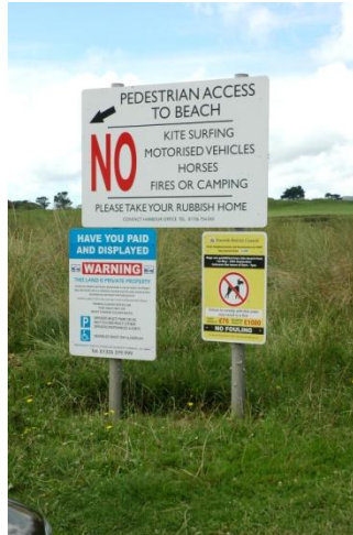
Signs at Harvey's Towans