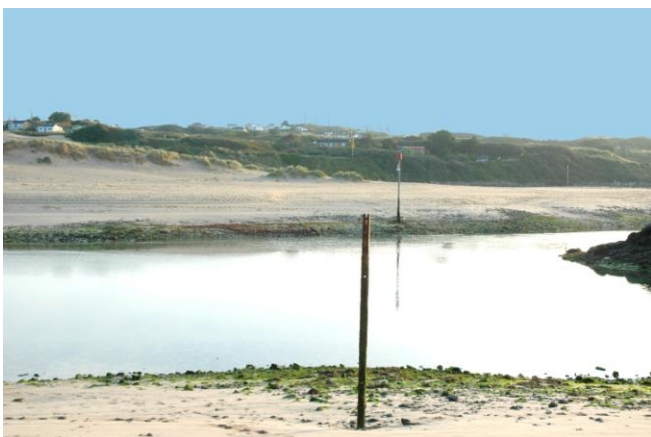
The Beach next to the river from Lelant Beach

There are safety/rescue points at various points above all the sections of beach. The RNLI have lifeguard Units at the main access point to Hayle Beach which is also the location for the Hayle Life Saving Club. There is also a lookout at Mexico Towans on the cliff at the edge of the dunes. Both units operate from mid May until late September with designated bathing areas which are well away from the dangers of the mouth of the estuary.