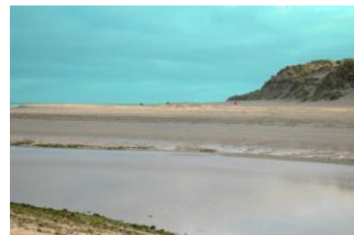
From Lelant Beach

TR27 5AF - The main car park (capacity 350cars+) for both Hayle Beach and Mexico Towans can be reached from the Copperhouse end of Hayle on the B3301 and the road signposted to Phillack and the Towans opposite a petrol filling station. Continue through Phillack and further on a large holiday complex on the right and chalets on the left; the road turns sharp left and the car park is on the left. Opposite the car park entrance is a public footpath (180m) to the main part of Hayle Towans Beach; by going down this footpath and turning right on to the