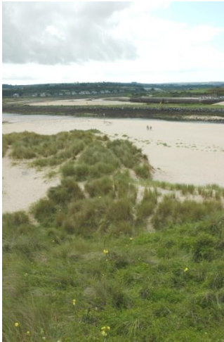
View across to Carnsew Pool