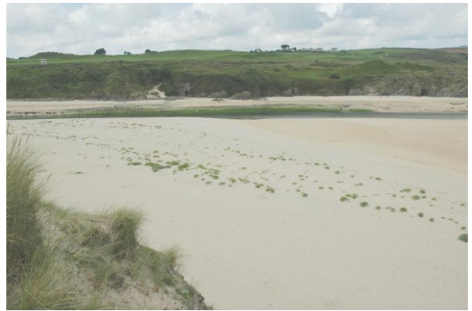
Harvey's Towans looking across the river to Lelant Beach

Beach and Porthkidney Sands . Under no circumstances should an attempt to be made to cross the river even at low water.