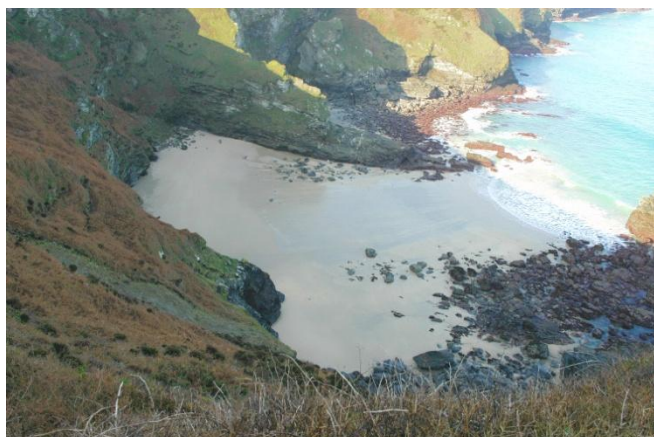
Fishing Cove in winter shade at low water

Sometimes known as Fisherman's Cove, this sandy beach nestles below 80m cliffs to the east of Navax Point. It faces north and can be in the shade even in summer unless the sun is high in the sky. It can be fairly sheltered from the westerly winds and even the extremes of the Atlantic swell. It is well known as a naturalist beach. The cliff path access is not too difficult but the drop on the seaward side of the path is not for those who suffer from vertigo. Castle Giver Cove is immediately adjacent to the west and can only be reached from Fishing Cove at low water.