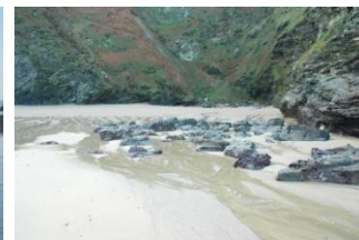
Views of Fishing Cove