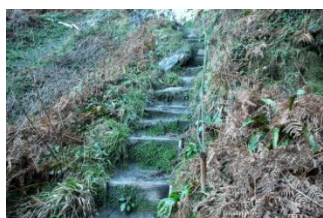
Steps down to the beach

TR27 5EG - Take the B3301 coast road from Hayle to Portreath and 2kms north of Gwithian village at the start of 'North Cliffs' there is a small parking area immediately on the left next to the road (capacity 20+cars), about 500m before reaching Hell's Mouth. Walk down the path that leads from the parking area and after 100m the Coast Path joins it on the right; continue on for a further 150m and on the right is a small path that leads to the cliff edge and winds its way down the cliff with steps on to the beach at the bottom. It is not a particularly difficult decent but needs to be undertaken with care as there is a point where it is suffering from erosion.