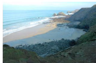
Greenbank Cove in winter