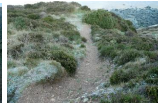
Access path to Greenbank Cove

a narrow path on the cliff edge which winds torturously down to the beach and is only advisable for those with a sure footing as at one place the path is next to a sheer drop to the beach. At Deadman's Cove it is possible to walk along the foreshore at low water to an unnamed sandy cove immediately to the west and then on to Derrick Cove (750m), a narrow sandy inlet but beware of the tides.