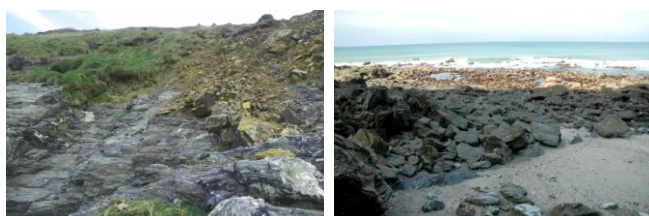
Access above Deadman's Cove Deadman's Cove

TR14 OJG - On the B3301 from Portreath to Hayle, there are 3 National Trust parking areas (close together) next to the road 4kms from the centre of Portreath. The most easterly of the parking areas (capacity about 20 cars), which is right next to the cliff edge, is the best for both Coves. There is a public footpath down to Deadman's Cove from the Coast Path (next to the car park). The path is narrow and steep in places and at the bottom a recent cliff fall has taken away the path and it means negotiating down loose rocky scree to rocks above the beach. To get to Greenbank Cove means walking along the Coast Path for nearly 400m east of the car park and there is