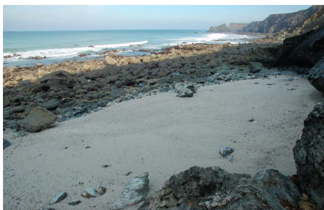
Deadman's Cove at low water with long winter shadows

In the centre of 'North Cliffs', the stretch of coastline between Gwithian and Portreath known as Reskajeage Downs, these two north facing coves are at the base of some spectacular cliffs that are over 80m high. Access to both Coves is difficult and should not be contemplated by anyone that is not confident of negotiating the narrow and at times steep routes down to the beaches. At low water it is possible to walk along the foreshore to both Coves from Basset's Cove which is some 700m east of Greenbank Cove.