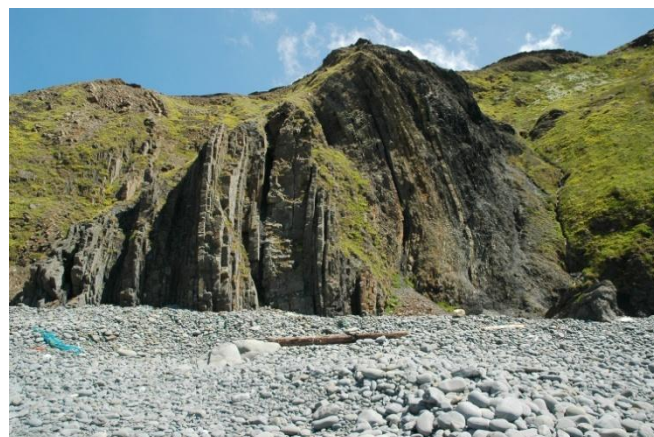
Cliffs and rock formations above Stanbury Beach