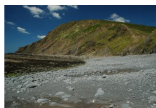
Stanbury Beach above high water In summer

The beaches are not cleaned and there are large amounts of water borne litter above high water. The water quality is excellent.