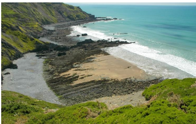
Stanbury Beach with Rane and Holacombe beyond

These are an extensive series of beaches between Higher and Lower Sharpnose Points which are accessible from Stanbury Mouth. All are remote and for the more adventurous. The cliffs along this stretch of coast are some of the best in Cornwall comprising of classic heavily folded sedimentary rocks.