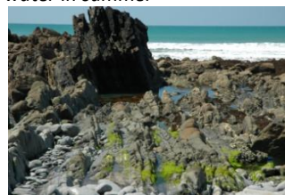
Rock pools at Stanbury Beach