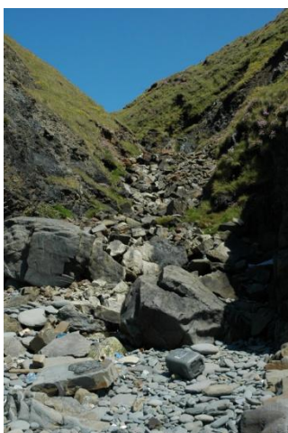
Rock strewn path access to Stanbury Beach

From the lower parking area there are two