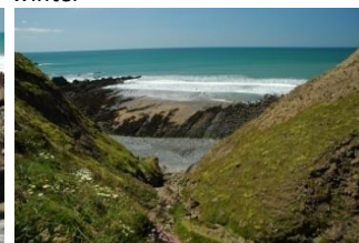
View from the path acces