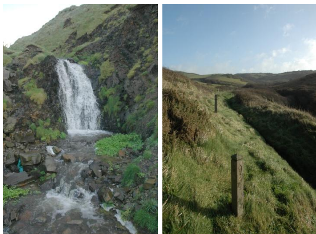
The waterfall next to the access path above Stanbury Beach in winter