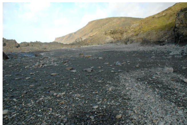
Rane Beach in winter

All four beaches are similar in makeup. In summer, Stanbury Beach has a sizeable area above the high water mark which is mostly shingle, stone and rock outcrops with small patches of greyish sand. At low water areas of fine yellow sand are exposed together with distinctive rock platforms whose geology defines the character of this stretch of coastline. In winter, especially after storms, there can