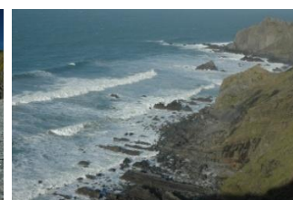
Caunter Beach at half tide in winter