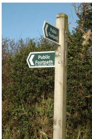
Signposts to the beaches at the end of the access road

public footpaths – both are marked and obvious. One runs down into the valley then follows the valley bottom and joins the Coast Path. It can be very wet, especially in winter and is about 900m in length. The other is signposted to the Coast Path and follows a well defined route across farmland and is slightly shorter (800m). It joins the Coast Path above Caunter Beach but involves a steep decent to the valley bottom and hence a climb on the return. Both paths lead to a short permissive access to the beach next to the stream. As a result of recent flooding the line of the path has been seriously eroded and strewn with unstable rock. In winter, the path and the stream are as one making access precarious.