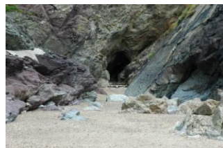
A cave and purple rocks

Pentireglaze Haven is a wonderfully sandy beach with a small area of sand above high water and a small stream crossing the beach. Although it faces