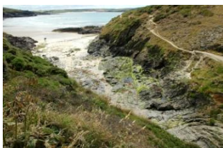
Pentire Haven inlet

PL27 6UG - 7kms from Wadebridge on the B3314 the road to New Polzeath and Pentireglaze is signposted; after a further 3.5kms at new Polzeath there is a car park (capacity 130 cars) which is the nearest to both beaches. There is roadside parking along Atlantic Terrace (about 60 cars) but this largely serves Polzeath Beach; there are parking restrictions on other roads. The Coast Path to Pentireglaze Haven is at the end of Gulland Road next to a property named Medla (160m). To get to Pentire Haven continue along the Coast Path for a further 500m or when the tide is out walk along the sand or park at Pentire Farm and walk down the path. Alternatively park at Polzeath and walk either across the beach (at low water) or along the Coast Path (about 700m).