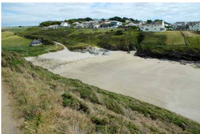
Pentireglaze Haven a sandy inlet with New Polzeath beyond

These two small inlet sandy beaches are part of Hayle Bay and joined to the beach at Polzeath at low water. Pentireglaze Haven is the larger and more popular.