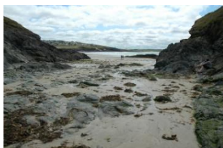
Sand and rock at Pentire Haven