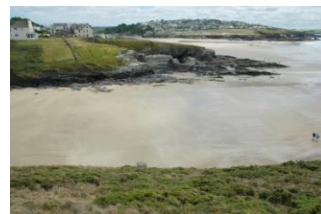
View out across Hayle Bay

west it can be surprisingly sheltered with a number of rocky outcrops (and caves). At low water the amazing expanse of Hayle Bay is revealed. On the southerly side of the inlet at Slipper Point there are unusual purple coloured rocks. Pentire Haven is a very narrow inlet of sand and rock with a stream crossing the beach and again joins up with the whole bay at low water; there is little or no beach at high water.