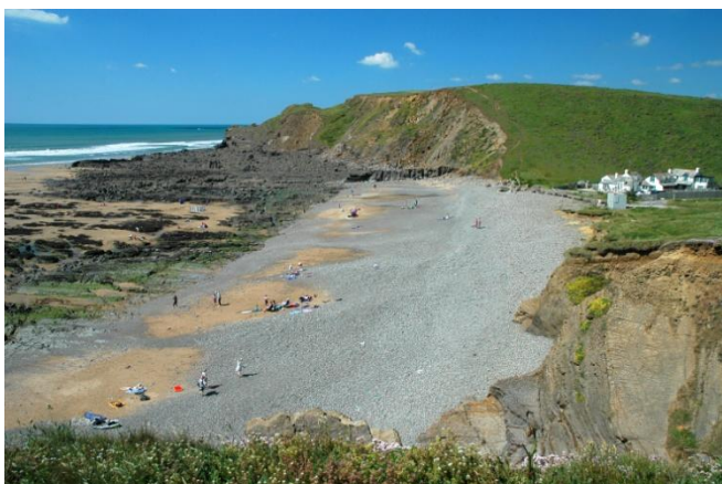
At low water looking towards Menachurch Point and Bucket Hill

It is part of a wonderful beach that at low water stretches from Summerleaze Beach , Bude in the south to Duckpool in the north. It is owned by the National Trust and is easily accessible.