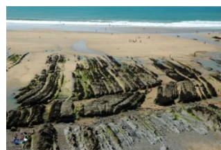
At low tide

Water quality is good although the quality of the stream crossing the beach is unknown. Generally it is a fine westerly facing beach that is at its best when the tide is low.