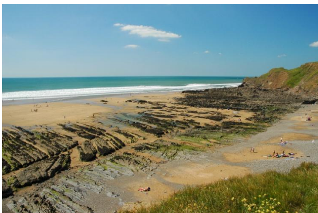
The rocky 'fingers' known as the 'Bude Formation'

EX23 9EL - North of Bude on the A39, take the signposted road to Poughill. Northcott Mouth is a further 3kms just beyond the Bude Holiday Park. The small National Trust car park (capacity about 60 cars) is on the left. There is a short walk of 200m along the road to the beach.