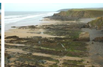
View from Maer Down