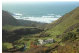
The Marshland Valley

This beach is the boundary between Devon and Cornwall with the river, Marshland Water, marking the boundary. Unfortunately, the best part of the beach lies in Devon, with the Cornish section, (although much longer), largely confined to rock platforms and stone but with sandy areas in summer. It is not an easy beach to get to and involves a walk.