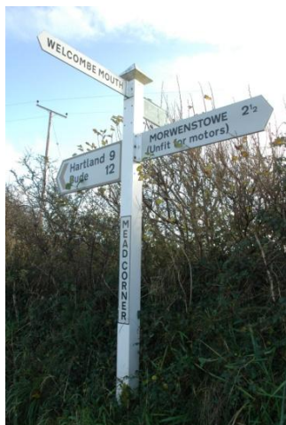
Footpath to the Beach

The water quality is unknown; the adjacent nature reserve is important for butterflies and is of national importance.