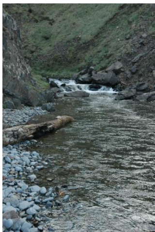
The river marking the boundary