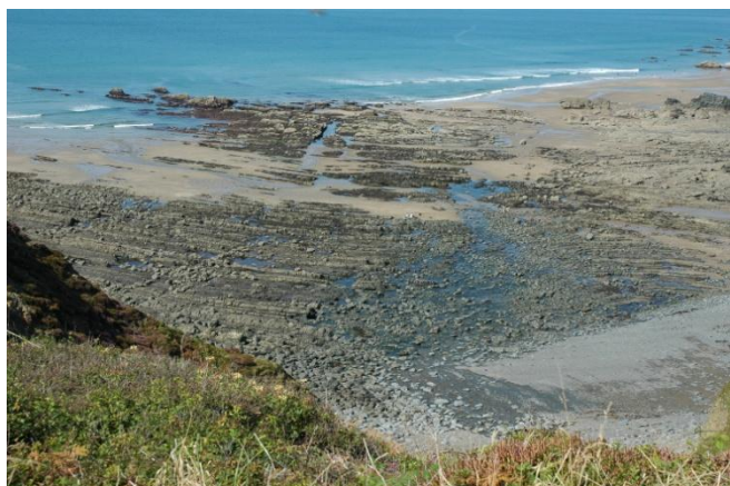
The mostly stony beach in summer at low water

Dogs are permitted all year. There are no facilities, not even nearby, except a pub at the hamlet of Darricott, south of Welcome.