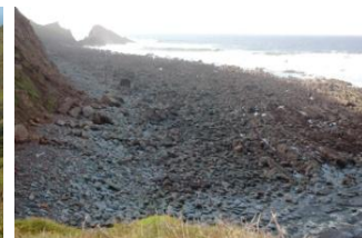
The Beach in winter

an attractive walk through the Welcome and Marshland Nature Reserve. Another way without going into Devon is by parking on a track north 100m north of Marshland Manor – EX23 9ST -and following the footpath (750m) to the beach.