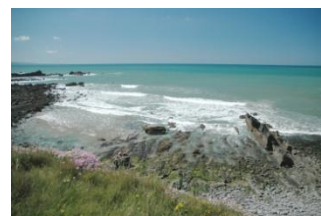
Surf at half tide

There are no refreshment or other facilities, the nearest being at Sandy Mouth .