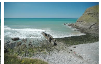
Looking towards Steeple Point