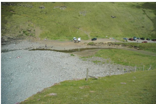
Stony beach above high water mark but is a lovely setting

The beach at high water is stone and shingle between Steeple Point and Warren Point and nothing like as appealing as low water when a fine expanse of yellow sand is bounded by the characteristic rock formations found along this stretch of coast. At low water it is possible to walk along the foreshore beyond Warren Point quite easily southwards to the Warren Beaches which consist of two small coves,