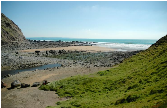
At low water looking towards Warren Point

At the end of the delightful Coombe Valley it is a westerly facing beach between high cliffs. It is owned by the National Trust and is easily accessible for all.