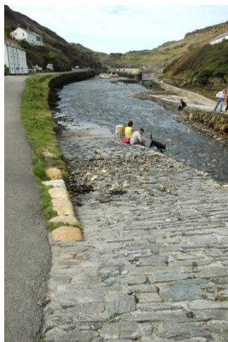
Slipway to the harbour

The slipway can be used to launch kayaks and similar small craft. Water quality in the Harbour depends on the very variable quality of the river. Boscastle in Cornish is 'Kastell Bosterel'.