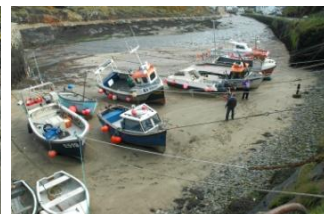
Within the Harbour

which is in the valley bottom next to the river. There is no roadside parking in the summer months. The main village of Boscastle is on the hill to the south of the valley. From the car park it is a 500m walk along the southern side of the River to get to the foreshore.