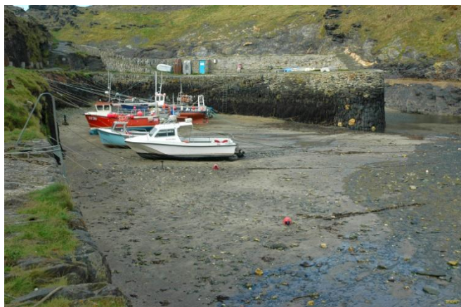
The small sandy beach within the harbour walls at low water

There are no restrictions on dogs. The toilets are at the entrance to the car park and include facilities for the disabled. There are cafes, small shops, restaurants and pubs close by.