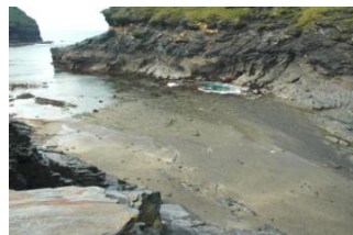
Outside the Harbour

People flock to this small picturesque harbour and village for its charm and not for its rather small and uninteresting beach which is both sides of the harbour walls and dissected by the River Valency that flows down the valley and through the harbour and most well known for the notorious floods of 2004. The harbour was originally built in 1584 in a narrow rocky inlet sheltered by Willapark headland to the west and Penally Point to the east. As it was the only significant harbour along this stretch of coast it was important for importing coal and limestone and exporting slate and local produce; nowadays it is a fishing harbour owned by the National Trust.