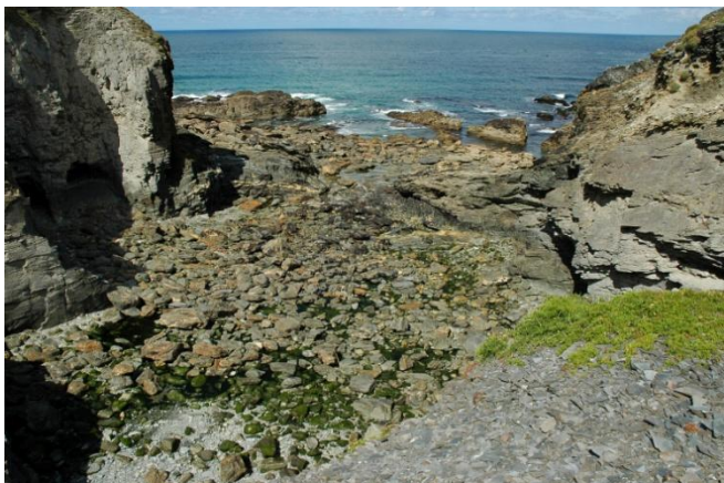
The rocky inlet at low water

A rocky cove that is close to Trebarwith Strand and somewhat unusual in that the upper part of the inlet has been subject to former slate quarrying activities creating a 'gorge' shaped access along the stream bed into the cove and shingle and stone beach.