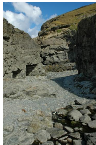
The 'gorge' hewn from the slate

and then turning right for a further 500m. There is a public footpath signed from the road opposite Trebarwith Farm (next to a bench); there are a number of roadside parking places in the vicinity but care needs to be taken not to obstruct gateways. It is an easy walk down the valley (1km) to the Cove.