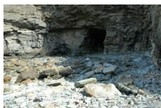
The stony slate beach