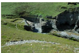
The inlet from the Coast Path