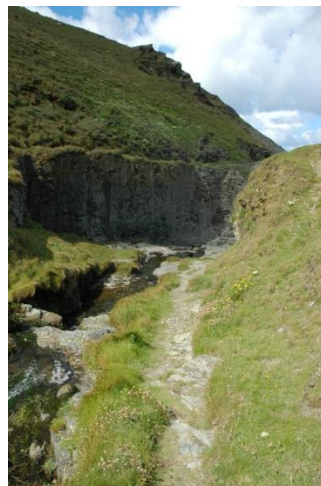
Path down to the Cove