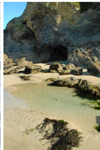
Cave in Flory Island

goes out over 300m to reveal a wonderful stretch of flat golden sand. At normal low tide it is possible to walk on the sand around the prominent Zacry's Islands to the north of the beach to Watergate Bay and the sheltered Fruitful Cove. There is a small area of stones at the access to the beach and nearby is Flory Island or Black Humphrey Rock with one of many caves one which is known as Cathedral Cavern.