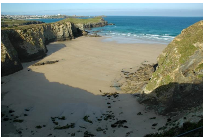
Early morning in summer with Trevelgue Head on the left

Although it is situated close to Newquay , Whipsiderry Beach is often little known and different in character and use than all the other more well known beaches associated with the resort. Stretching from Trevelgue Head (next to Porth Beach ) in the south to Zacry's Island (and Watergate Bay beyond) in the north; it is over 600m long. It faces west and although exposed to the Atlantic swell can be quite sheltered. Its name is derived from mining terms 'Whips' and 'Derrick'.