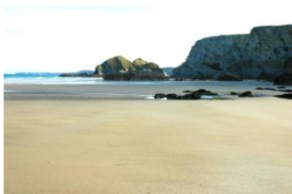
Zacry's Islands beyond

There is no beach at high water but the tide