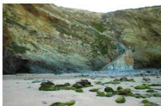
the steps down the cliff face