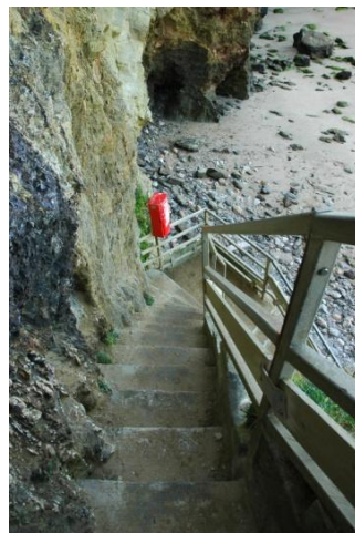
Flight of steps