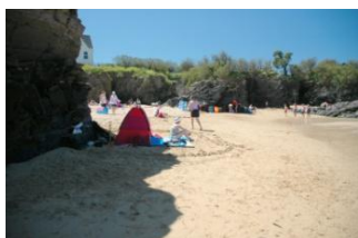
A secluded part of the beach