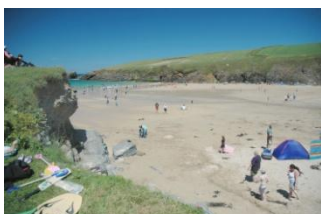
The area of sand at low water

There are two short flights of steps from the cafe car park on to Trevone Beach whilst there is an easy access from the other car park which is suitable for those with certain disabilities. Access to Newtrain Bay is along the road from the cafe car park; it is a short walk (150m) and is marked as the Coast Path.