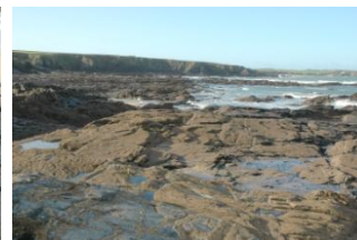
Rock platforms and mussel beds