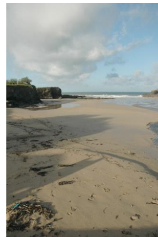
A winter view at low water

Trevone is a family friendly beach that has much to offer especially at low water. There is a large 'blow hole' in the cliffs on the north-eastern side of the beach known as Round Hole. It is over 27m deep and during stormy weather is worth the short walk from the beach to view the spectacle although care needs to be taken.