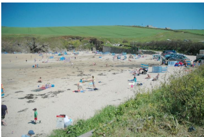
Above High Water in summer

Part of a stretch of coastline with some of the best beaches in Cornwall, Trevone is a gem and somewhat of a surprise. An 'inlet' sandy beach, it has high cliffs on one side and a series of rock platforms on the other leading to Newtrain Bay which is known as Rocky Beach by the locals.