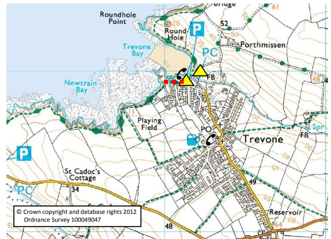
Location – Part of OS Explorer Map 106

from Easter until October but also at weekends throughout the year. The village (300m from the beach) has a local pub, Post Office and General Stores.