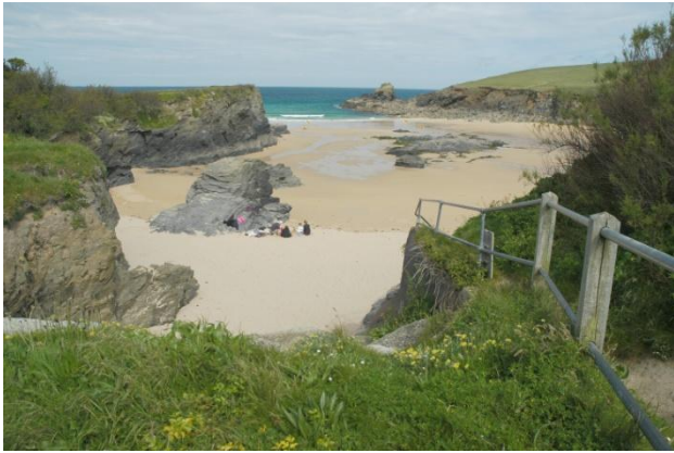
One of the access points and steps down to the beach

when the conditions seem docile). A large warning sign on the cliffs above makes this apparent. It is advisable to only enter the water when the Lifeguards are on duty and then in the designated area.