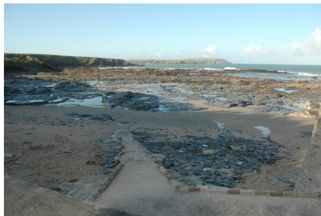
Newtrain Bay (Rocky Beach)

There is safety/rescue equipment all year at both beaches. Lifeguards are on duty on Trevone Beach from mid-May to late September but not at Newtrain Bay. The Lifeguard facilities are prominent at the beachhead. There is a designated and patrolled bathing area