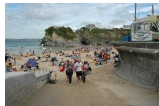
The slipway in summer

rocks and pools around the Island and headland. The grass amenity area above the beach has numerous seats. There is a small sea filled bathing pool next to the Island but is often filled with sand.