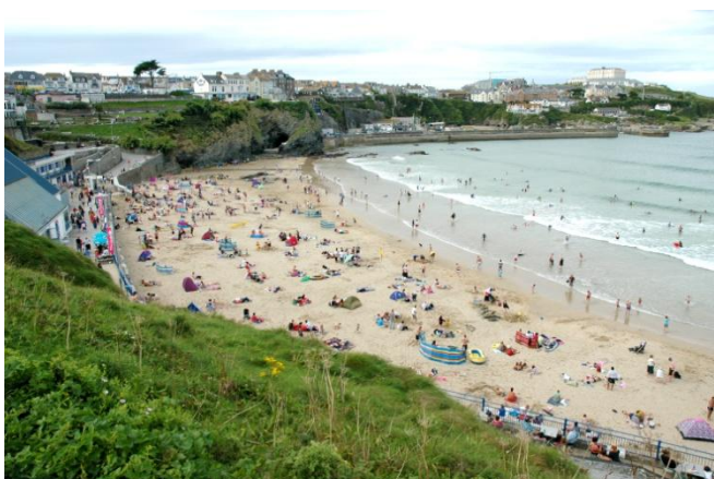
In summer at half tide

Towan Beach (or Town Beach) is the nearest to the centre of Newquay and within short walking distance.