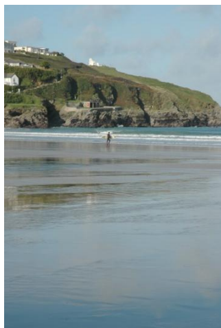
The Beach in winter