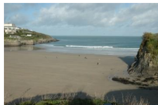
At low water in winter