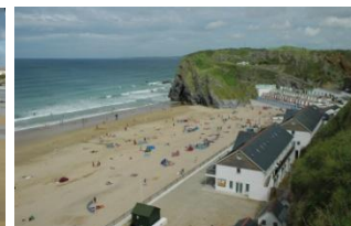
View from Narrowcliff

A popular privately owned beach with a wide range of facilities that is close to the centre of Newquay.