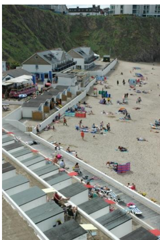
All the facilities

Water quality is excellent. The beach is cleaned twice daily in summer. It is a fairly sheltered beach that is good for families resulting in it being very crowded in high summer; the cliffs tend to shade parts of the beach later in the day. The rows of beach huts are very much a feature.