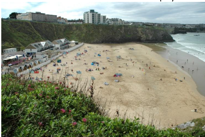
The beach on an incoming tide

A popular privately owned beach with a wide range of facilities that is close to the centre of Newquay.