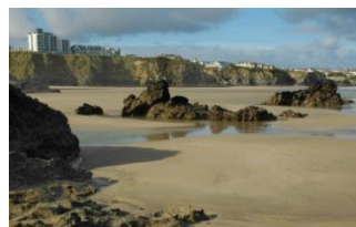
At low water