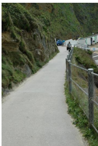
Access road to the beach