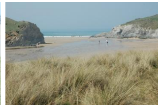
The inlet beach in summer