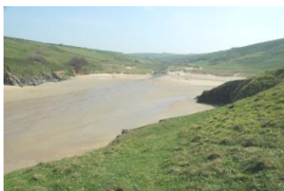
The head of the inlet

TR8 5SE - From the A3075 just south of Newquay there are a number of roads which are signposted to Crantock. Continue through the village and follow the signs to West Pentire which is a further 1.5kms. At the end of the road there is a track on the left which leads to a car park (capacity over 200 cars). There is also a car park (capacity 100 cars) below the pub which largely serves Crantock Beach but is an alternative. The public footpath to the beach (550m) is signed from the end of the road. An alternative access is a car park (capacity 70 cars) in the valley - TR8 5QS - which can be reached by turning off the road from Crantock to Pentire through Treago Farm and camp site down a public byway to Treago Mill. There is a footpath (600m) which leads to the beach.