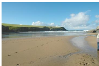
A flat sandy beach