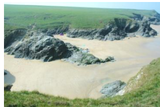
Secluded sandy areas