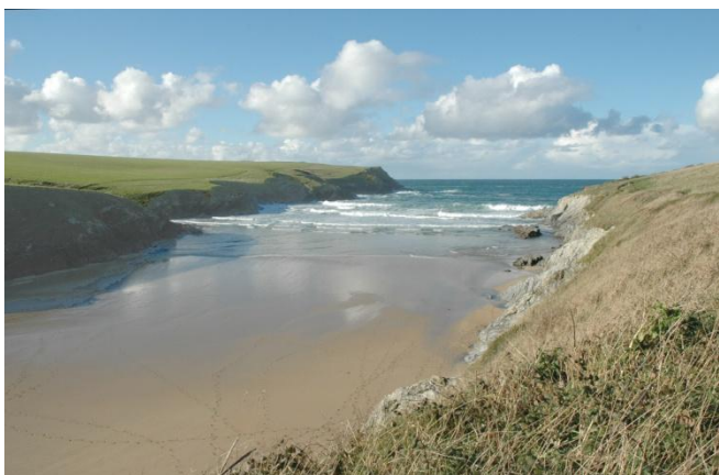
At low water in winter with Kelsey Head in the distance

A north westerly facing inlet beach set between two prominent headlands, Pentire Point West and Kelsey Head. It is at the mouth of a wide valley made up of Cubert Common and The Kelseys, a large historical sand dune area that is now grazed and largely owned by the National Trust. One of the endearing qualities of the beach is the lack of any development at all and the openness of the surrounding landscape yet it is easily accessible after a short walk.