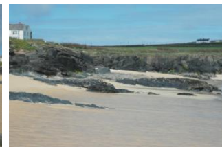
Looking towards Long Cove