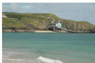
The Lifeboat Station