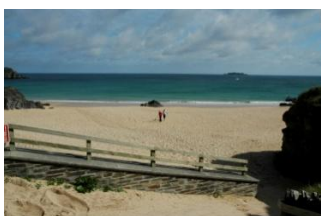
The main access point

Parking on the approach (private) road to Trevoze Head should not be considered due to restrictions.