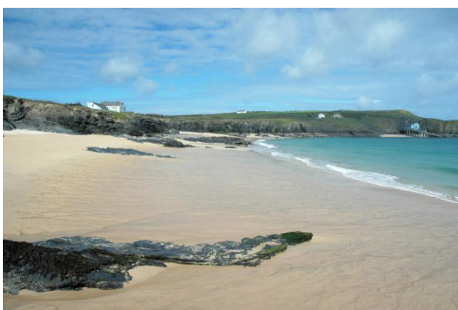
View at low water looking northwards to Trevoze Head

A striking sandy beach that faces north east but is remarkably sheltered from the Atlantic swell and prevailing westerly winds by Trevoze Head. It is privately owned by the adjacent Caravan and Camping Site, although there is legitimate access from the Coast Path. Its unusual name is taken from the legend of a local wise-woman called 'Mother Ivey'.