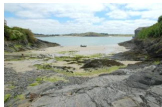
View across the Camel Estuary

A delightful little cove on the north westerly side of the Camel Estuary in the lee of Stepper Point with fine views across the Estuary to Daymer Bay and Polzeath . The cove is backed by a small hamlet of terraced cottages, a few detached properties, a coastguard lookout and a former lifeboat station. At low water there is a vast expanse of sand including the infamous 'Doom Bar' which even to this day is a danger to shipping. When the tide is out it is easily possible to walk along the sand to adjacent Harbour Cove and St. Georges Cove nearer Padstow.