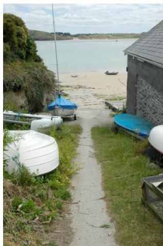
The slipway access

Water quality is very good. It is an intimate and rather tranquil Cove that provides an alternative to the often crowded beaches along this North Cornwall stretch of coast.