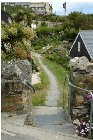
Path to the beach