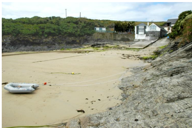
The sheltered sandy Cove

There are no restrictions on dogs. There are no toilets or other facilities the nearest being at Padstow or Trevone (5kms by car). It is not possible to access the slipway from the road.