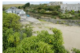
The Cove and hamlet

hamlet and Cove but from the car park it is easier to walk down to the Coast Path and northwards from Harbour Cove;