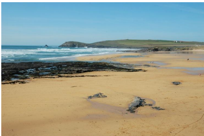
View at low water looking towards Trevoze Head

PL28 8JJ - On the B3276 coast road from Padstow to Newquay is St.Merryn (4.5kms from