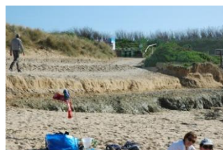
Access to the beach

The car park next to the beach involves a very short walk along the vehicular access track and then a