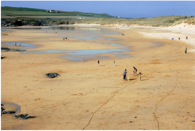
Enough flat sand for a game of cricket!

the north includes Constantine Island. Finding shelter on windy days can be a problem but in other respects it is a fine family beach. A stream crosses the beach.