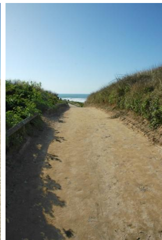
Access track to the beach

Padstow). 350m west of the cross roads at St.Merryn is a signposted turning to Constantine Bay; after 1.3kms bear left and then first right and after a further 500m there is a car park on the right (capacity 300 cars) which tends to be only open during the main summer months. A further 250m on at the end of the road is a small car park (30 cars) but this can often be full at weekends out of season. There is little or no roadside parking because of parking restrictions during summer and the lack of available places to park without causing an obstruction. An alternative that is favoured by many is to park at Treyarnon Bay .