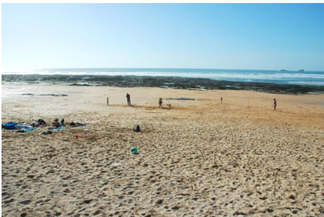
The rocky reef that is so good for surfing when the tide comes up

This beach is regarded by some as one of the best surfing beaches in Cornwall with a classic beach break that is hollow, fast and often powerful. Facing due west it gets the full Atlantic swell with a swell size that starts working well at less than 1m and holds up to over 2m. It is not a good choice for beginners as