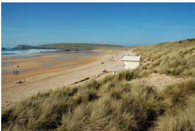
The sweeping beach and sand dunes

A splendid sweeping westerly facing beach that is backed by an impressive sand dune system and next to Trevoze Golf Course. At low water it joins up with Boobys Bay but is separated at higher tides by a line of rocks. It is set in one of the most open coastal landscapes in Cornwall so can be exposed from many angles but this also gives it a wonderful 'open' feeling.