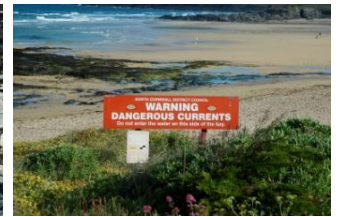
You have been warned!