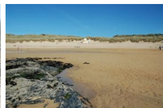
Rocky ledges and sand

sandy ramp on to the beach itself; alternatively to get to the far side of the beach there is a path that runs through the sand dunes from the car park. From the main car park it is a 250m walk down the road. If parking at Treyarnon Bay it is an easy flat 500m walk along the Coast Path past Chair Cove which has some great views along the coast.