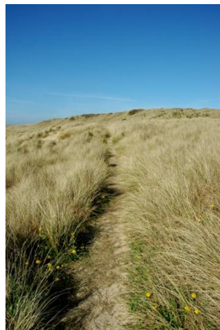
Path through the sand dunes