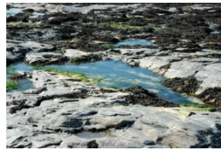
Great rock pools

Dogs are allowed on the beach all year. There are toilets (including disabled) by the small car parking area above the beach.